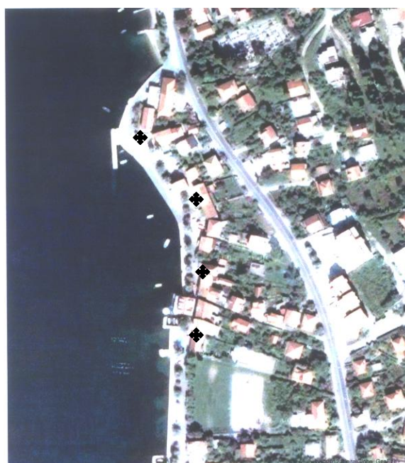
Figure 2: Satellite view of tourist resort with marked measurement positions

Tourist village Donja Lastva extends directly along the sea coast. To perform the experiment we selected the four positions that characterize the different sources of noise (Figure 2).